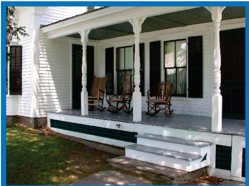
Three rockers welcome passersby on the front porch of the President Calvin Coolidge summer White House in Plymouth Notch, Vermont.